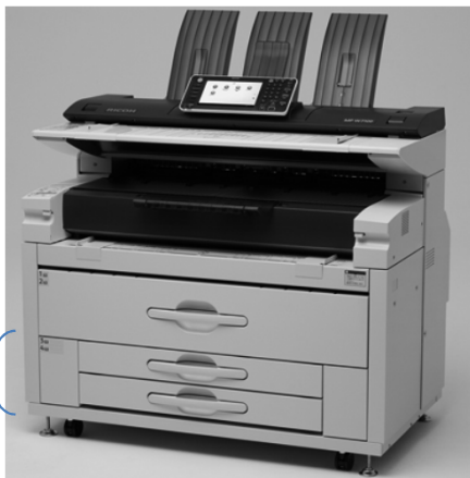
The environmental load of the optional 2-Drawer Paper Cassette unit (※) is included in the results.

Environment Contact: RICOH Company, Ltd. Corporate Communication Center email : envinfo@ricoh.co.jp