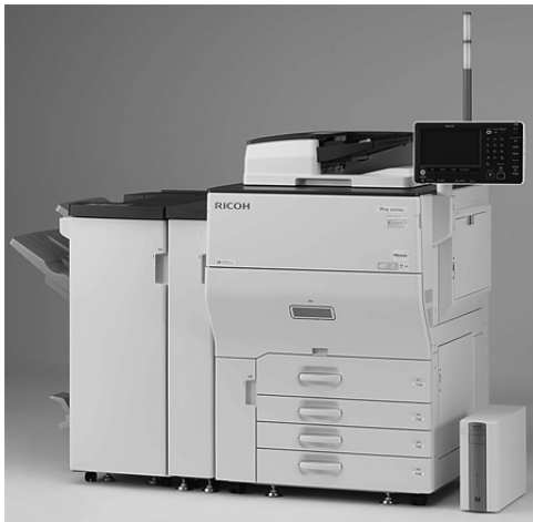
The photo shows the RICOH Pro C5110s with plural optional accessories attached. The environmental effects of these accessories are not included in this calculation.

Environment Contact: RICOH Company, Ltd. Corporate Communication Center email : envinfo@ricoh.co.jp