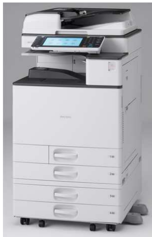
The photo shows the MP C3003SP with the Two-Tray Paper Bank (option) attached.

Environment Contact: RICOH Company, Ltd. Corporate Communication Center email : envinfo@ricoh.co.jp