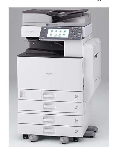
The photo shows the Aficio MP C5502G with the Paper Bank Unit (option) attached.

Environment Contact: RICOH Company, Ltd. Corporate Communication Center email : envinfo@ricoh.co.jp