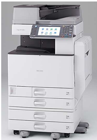
The photo shows the Aficio MP C4502A with the Paper Bank Unit (option) attached.

Environment Contact: RICOH Company, Ltd. Corporate Communication Center email : envinfo@ricoh.co.jp