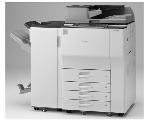
The photo shows the Aficio MP 7502SP with 2,000-Sheet Finisher SR4070 (option) attached.

※Figures in ( ) indicated environmental impact including recycle effect *note3