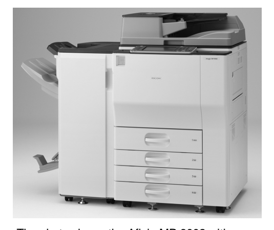
The photo shows the Aficio MP 6002 with 2,000-Sheet Finisher SR4070 (option) attached.

Figures in ( ) indicated environmental impact including recycle effect *note3