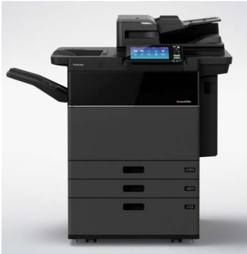
2 Drawer + Tandem LCF (LCF: Large Capacity Feeder)