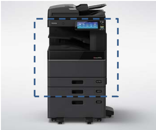
Document Feeder and Large Capacity Feeder are optional units. They are not included in the calculation.