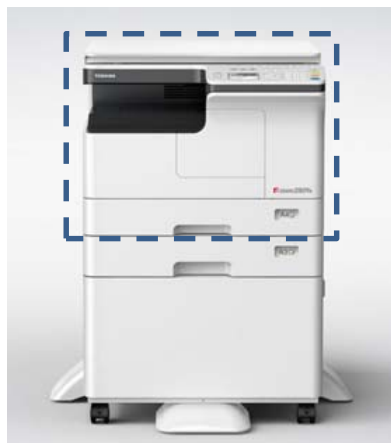
Paper Feed Unit and Desk are optional