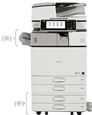
The photo shows the product with the optional units (X) attached. The environmental loads of the optional units are not included in the results.

※Figures in ( ) indicated environmental impact including recycle effect *note3