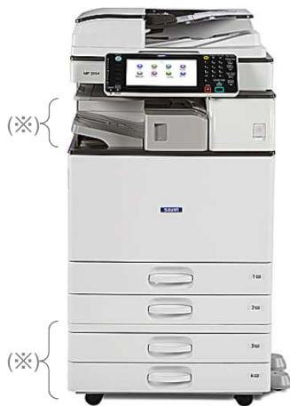
The photo shows the product with the optional units (X) attached. The environmental loads of the optional units are not included in the results.

※Figures in ( ) indicated environmental impact including recycle effect *note3