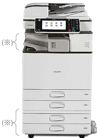
The photo shows the product with the optional units (X) attached. The environmental loads of the optional units are not included in the results.

※Figures in ( ) indicated environmental impact including recycle effect *note3