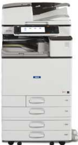
(※) The photo shows the product with an optional Paper Feed Unit (※) attached. The environmental load of the optional unit is not included in the results.

※Figures in ( ) indicated environmental impact including recycle effect *note3