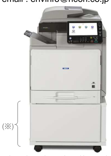
The photo shows the product with an optional Cabinet (**) attached. The environmental load of the optional unit is not included in the results.

Environment Contact: RICOH Company, Ltd. Corporate Communication Center email: envinfo@ricoh.co.jp